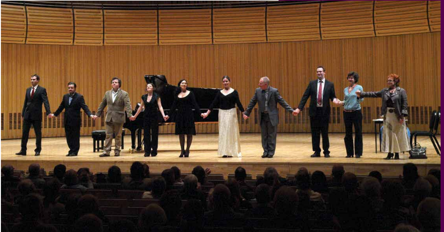
February's Masterclass line-up, Hall One The Sage Gateshead