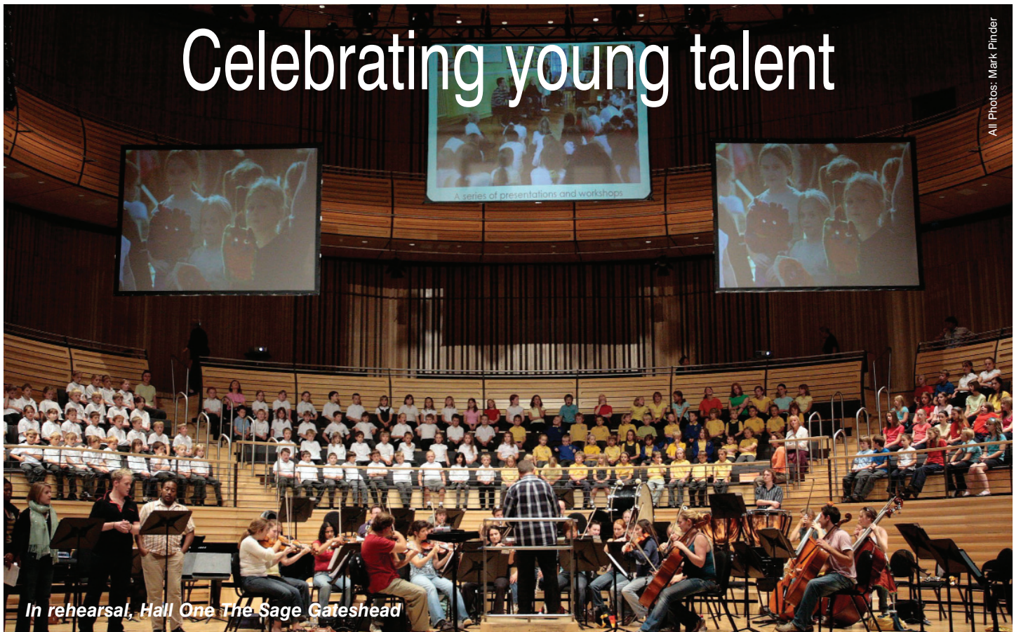
In rehearsal, Hall One The Sage Gateshead

It was a fitting end to what has been a truly innovative three-year education and outreach project in the Tyne Valley involving four schools, music, the visual arts, dance and many hundreds of school children and students.