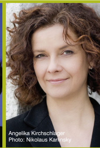
Angelika Kirchschrager