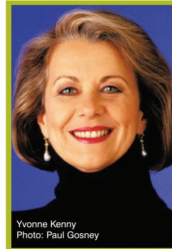
Yvonne Kenny