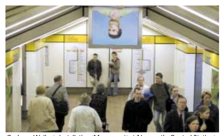
Carl von Weiler's installation 'Monument' at Newcastle Central Station's metro.